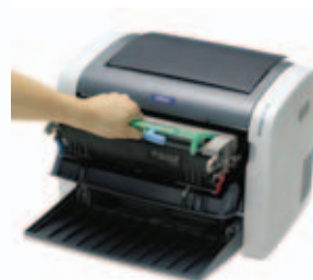
Easy access, front loading consumables

To enable simple configuration, monitoring and management across your network, the EPSON EPL-6200 is easy to use and available with EpsonNet configuration and monitoring tools*.