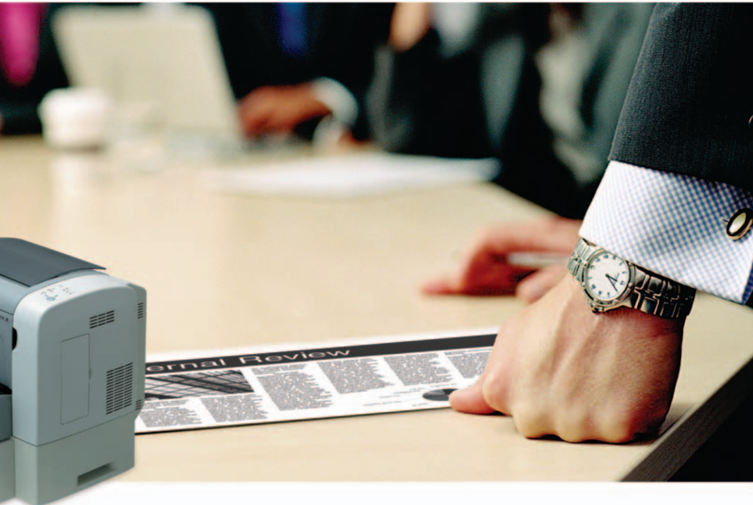
EPSON EPL-6200 with additional 500 sheet tray and duplex unit