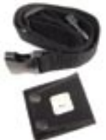
Belt & Clip for Holster