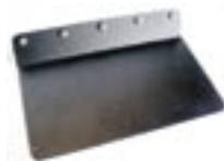
Keyboard Tray Bracket