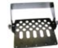
Top Mount Swing Arm Bracket & Computer Back Plate