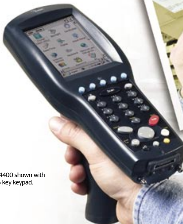
The Falcon 4400 shown with standard 26 key keypad.