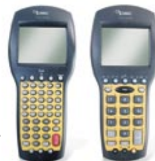
Keypad configurations available with the Falcon® 345