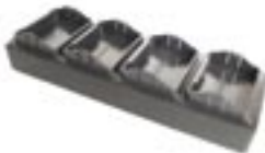
4 Slot Lilon Battery Charger