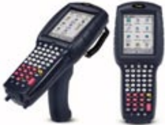
FALCON 4400 SERIES