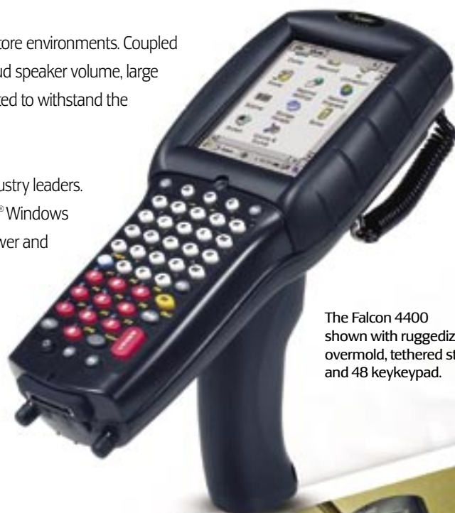
The Falcon 4400 shown with ruggedized overmold, tethered stylus and 48 key keypad.

Falcon® 4400 models with an integrated handle are ergonomically designed for scan-intensive applications. Non-handle models are contoured to fit comfortably in an operators hand for extended periods of fatigue-free data collection activities. The Falcon Management Utility and Falcon Desktop Utility are included with every unit providing remote management and configuration.