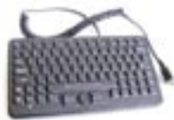
NEMA 4 Standard Keyboard