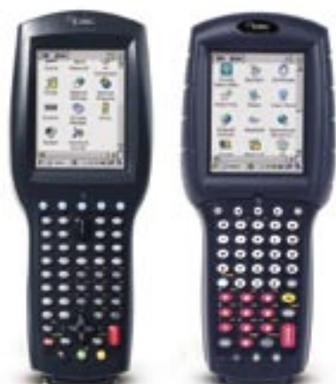
Falcon 4400 series computers are also available in non-handle versions.