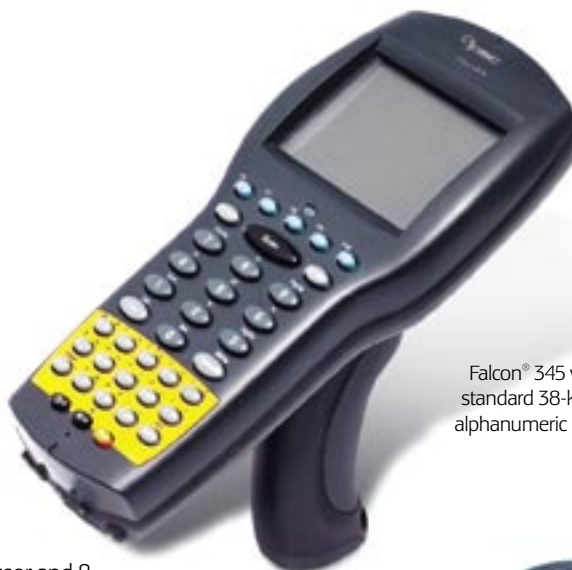
Falcon® 345 with standard 38-key alphanumeric keypad

Additional flexibility comes with the wireless connection of Falcon 345 terminals into an existing legacy system. The Falcon® 345 comes with a choice of 25, 38, and 48-key keypads. A batch model, the Falcon® 340 is also available.