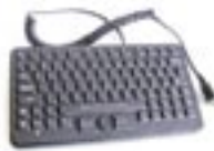
NEMA 4 5250 Keyboard