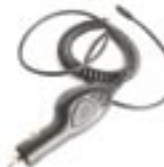
Car Charging Adaptor