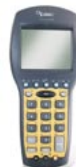
The Falcon® 335 is available with either a standard 38-key full alphanumeric or 25-key large numeric keypad