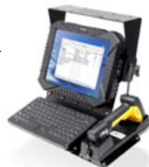
The Falcon® 4620 low profile mounting system features keyboard and PSC's PowerScan® RF handheld scanner