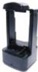
Vehicle Mount Dock & Charger