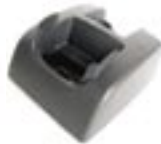
Single Slot Dock