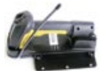
Scanner Tray Bracket