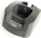
Single Slot Dock With Spare Battery Charger