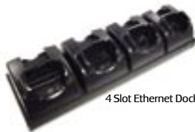
4 Slot Ethernet Dock