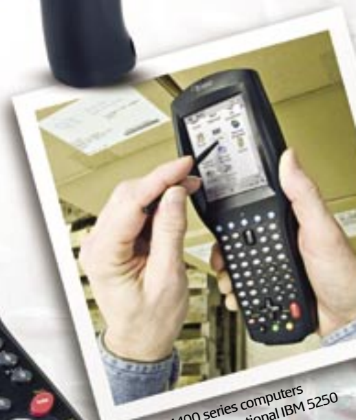
Falcon® 4400 series computers are available with optional IBM 5250 terminal emulation keypad.