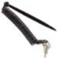
Tethered Stylus Kit