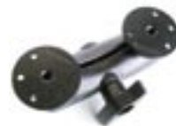
Rotational Ram Ball Assembly